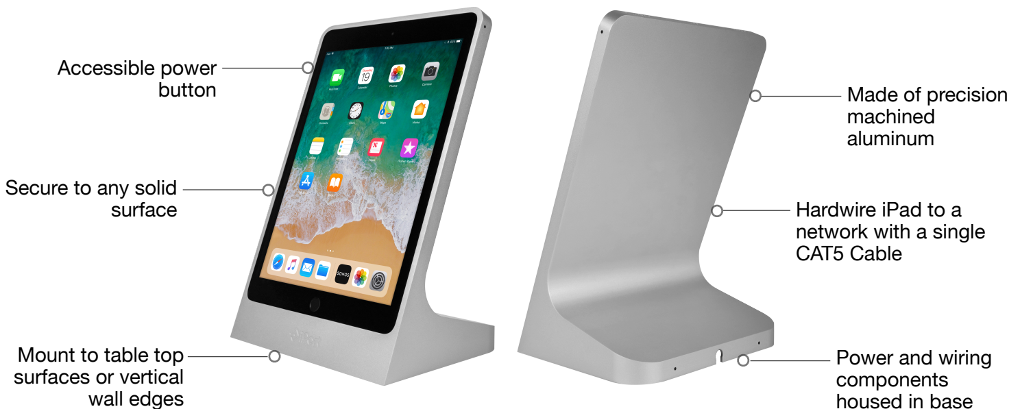
TABLE MOUNT FEATURES

The most elegant way to enclose and mount iPad to a any surface with the option for hardwired power and data for professional applications. Table Mount can be installed on a table top or mounted on the vertical surface of a wall for kiosk application. Security locks keep Table Mount secure in high traffic spaces. All power and wiring components are hidden in the base for a sleek elegant look and feel.