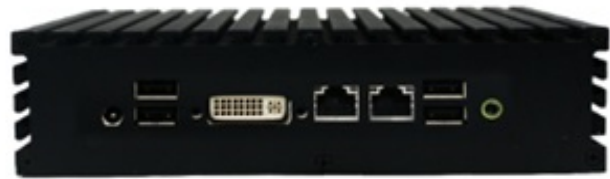
Rear I/O Port

BroadSoft's JAZZ Fusion Edge ESB Integration Manager is a specially designed software platform engineered to compliment BroadSoft's hosted JAZZ Fusion Call Accounting, Guest Personalization, PABX telemanagement and Middleware solution. Installed locally, JAZZ Edge ensures that the hotel PABX, PMS and voice mail systems maintain real time communication anytime regardless of external network interruptions.