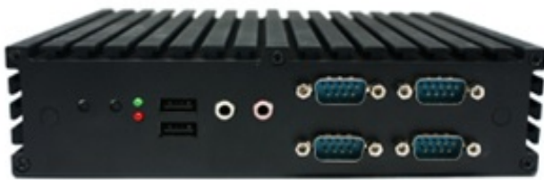
Front I/O Port