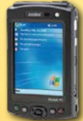
Windows Mobile Devices